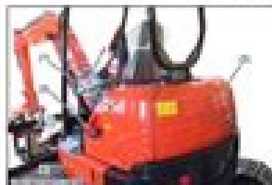
(a) Boom LH (b) Rear boom (c) Fuel cap