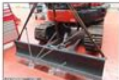
(a) Blade (b) Nylon sling 5. Remove the two pins from the blade, and blade assembly.