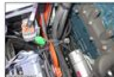
(a) Cabin suspension