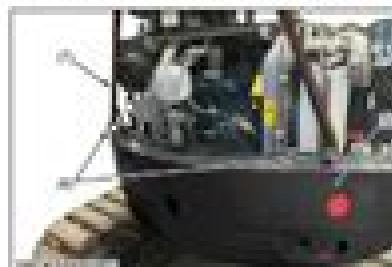
(a) Counterweight (b) Nylon sling