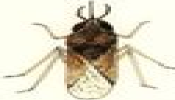
Big-eyed Bug 8 mm F: Aphids, small insects H: Meadows, Gardens