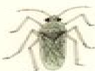
Dandelion Bug 12 mm F: Aphids, plant bugs H: Gardens, Meadows