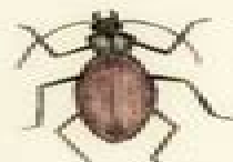
Boat-backed Beetle 20 mm F: Insects, Grubs, Larva H: Soil, Lawns