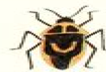
Two-spotted Stink Bug 12 mm F: Caterpillars, Larva H: Meadows, Crops, Gardens