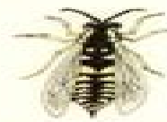
Yellow Jacket 34 mm F: Larva eats insects H: Throughout N.A.