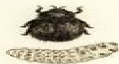
Black Ladybug & Larva 4 mm F: Aphids, small insects H: Foliage