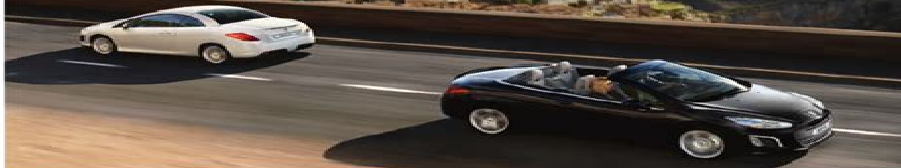
PEUGEOT 308 CC