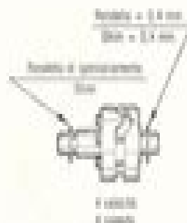
Fig. 26 Cuscinetti Carter con albero a camme

4) VERIFICARE la distanza dei cuscinetti dell'albero a camme da sul carter compresa la guarnizione centrale che sul posto e compensare le differenze con cordata di approssimazione disposte come indicate in figura. Il gioco assiale deve essere inferiore a 0,1 mm.