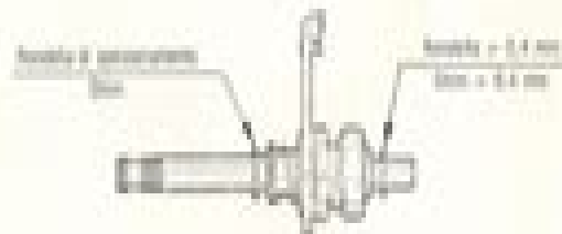
Fig. 27 Cuscinetti motore Carter olio motore

5) VERIFICARE la distanza dei cuscinetti dell'albero motore da sul carter compresa la guarnizione centrale che sul posto e compensare le differenze con cordata di approssimazione mantenendole come indicate in figura. Il gioco assiale deve essere inferiore a 0,1 mm.