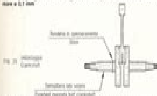
Fig. 24 Cuscinetti Carter con cuscinetti

Nel caso di lavori di compensazione il montaggio va eseguito senza gioco assiale, mentre per gli altri modelli il gioco assiale previsto nel caso del nuovo cuscinetto è 0,1 mm.