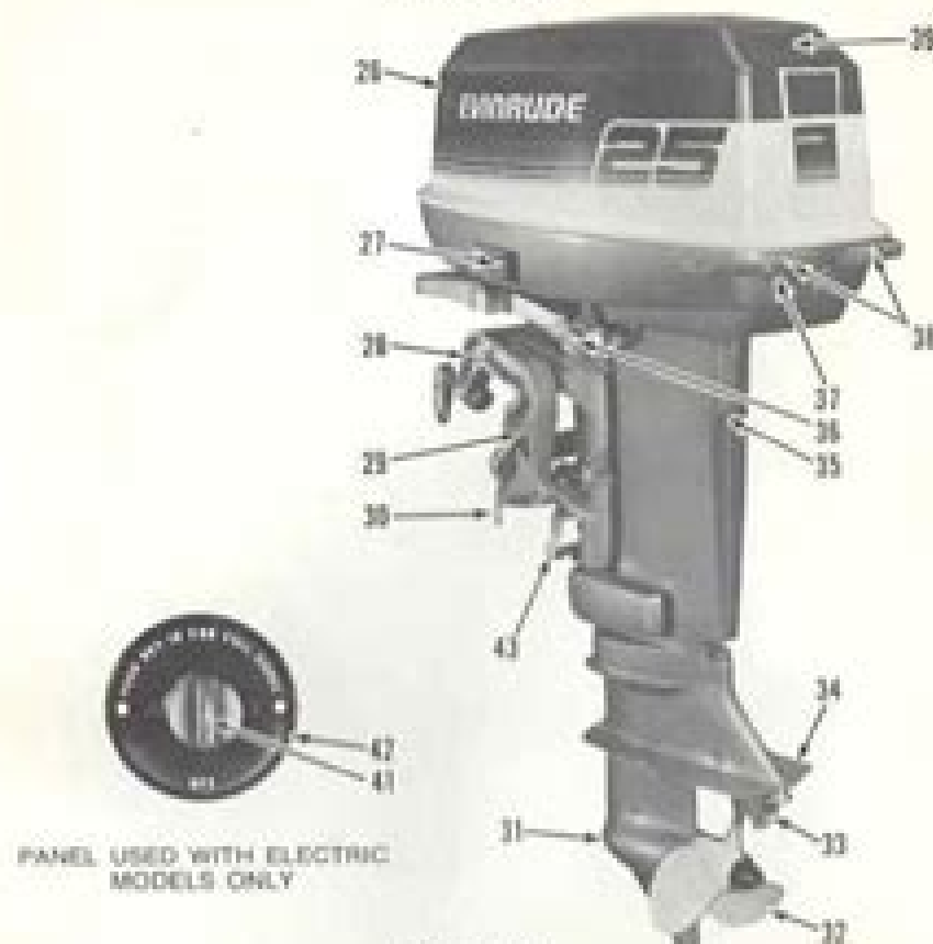
PANEL USED WITH ELECTRIC MODELS ONLY