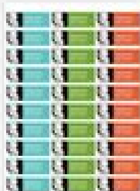
Photo address labels