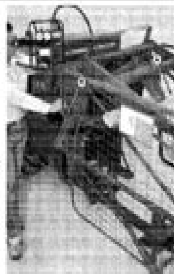
Illustration included as cover