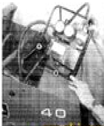
Illustration included as cover