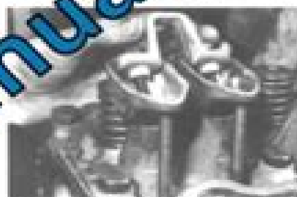
107.2 Representing the bridge type used will accurately show the