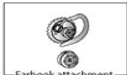
Earhook attachment (not supplied in all regions)