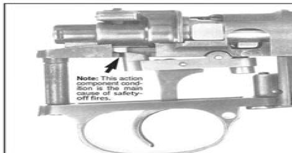
Figure 48- Shows the trigger sear in a cutaway M98 action blocked by cocking piece ledge overtravel that occurred when the trigger was cycled while the safety lever was in the safe position. This condition was caused by an altered top cocking piece safety lever engagement corner which reduced cocking piece/trigger clearance to less than zero. Note that this disconnects and blocks the trigger sear.