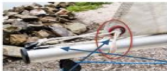
Tie clew to boom