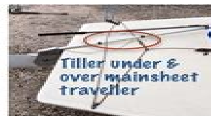
Tiller under & over mainsheet traveller