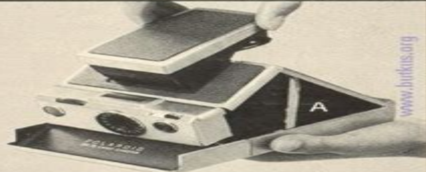
4. ...until cover-support (A) locks.