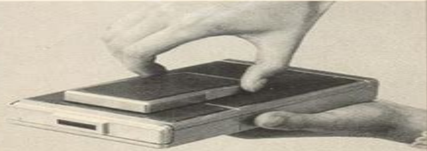
2. Lift small end of viewfinder cap.