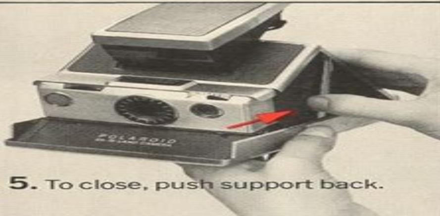
5. To close, push support back.