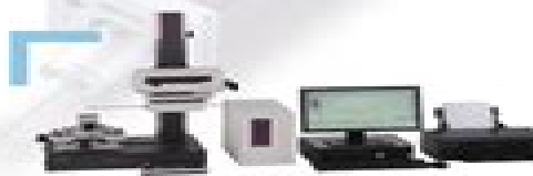
CV-3200 / CV-4500