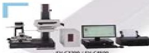
SV-C3200 / SV-C4500