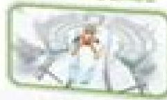
Just a few of the many ways to stay fit with Wii Fit Plus.