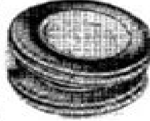
Dual Front Wheel Attachment