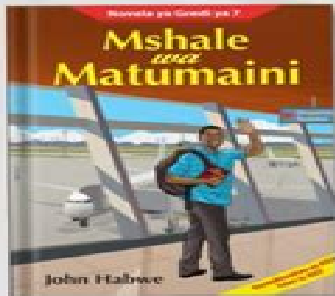
MSHALE WA MATUMAINI Novela ya Gredi ya 7

Get an easy foundation to Fasihi and literature by acquiring uniquely done literature texts