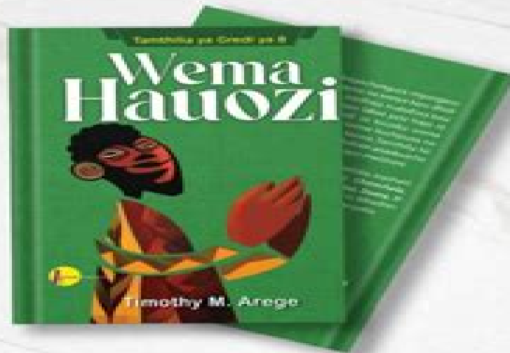
WEMA HAUOZI Tamthilia ya Gredi ya 8