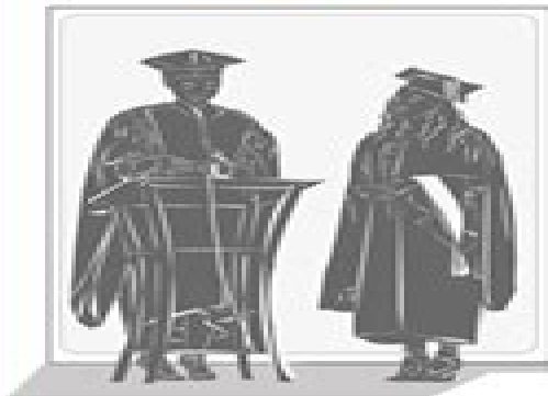
PHOTO 3 | SINGLE PORTRAIT