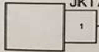
FIGURE 2-1 KT 70 INTERCONNECT DIAGRAM (Sheet 1 of 4)