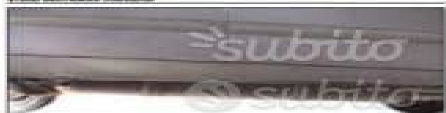
Urto bombola metano