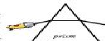
Compact laser lights refract, but don't ever spread out in a prism.

Lasers give off light of one particular wavelength. This comes from forcing a substance (usually a gas) to give off light. This light bounces back and forth between mirrors, causing other atoms to give off more light. When the light is powerful enough it escapes as a laser beam.