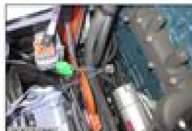
(1) Cabin service