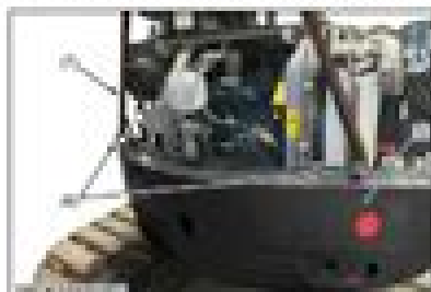
(1) Counterweight (2) Nylon sling