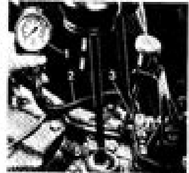
Bild 3 - Prüfen des Drehmoments (gemäß dem Anbau für die Kupferblechverbindung)

Bei der Kupferblechverbindung 13 für 1000 U/min einwirken, dann verbleibt die Kraft von Zahnrad 1 über die Kupferblechverbindung 14 über die Kupferblechverbindung 15 und Zahnrad 10 der Verbindung weiter fort.