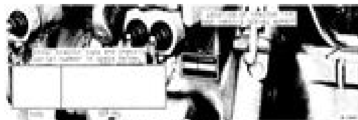
Tractor Type and Chassis Serial Number