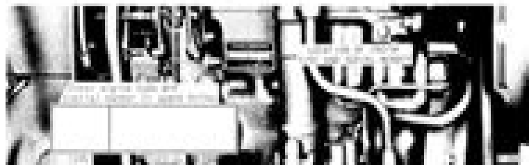
Engine Type and Serial Number