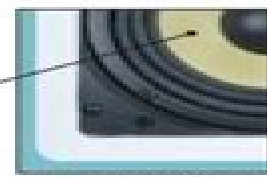
Woven Kevlar Cone with Rubber Surround