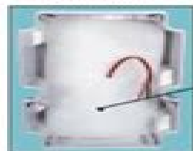
Polyfill Damped Rear Enclosure