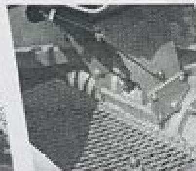
Fig. 27 - Installing Platform