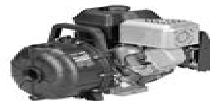
Gasoline Engine Drive Close Coupled