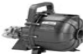
Hydraulic Drive Close Coupled