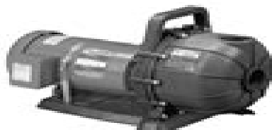
Electric Drive Close Coupled