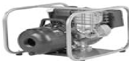
Gasoline Engine Drive with Optional Roll Cage