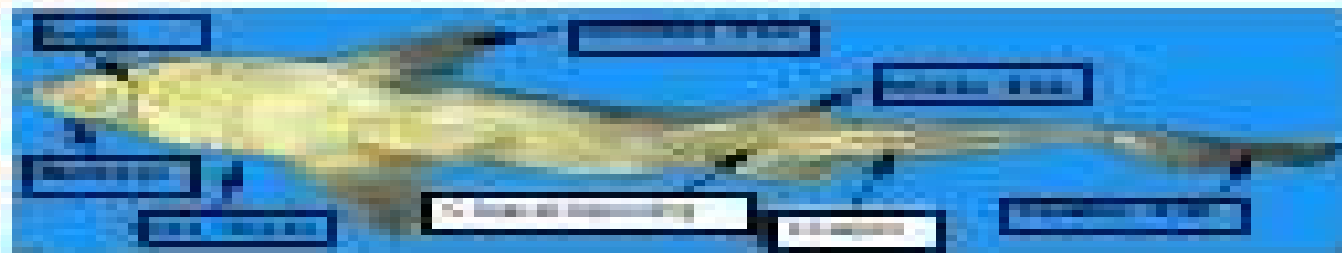
Figure 1: Atlantic Shortfin Mako (highlighted) above the corresponding labels.