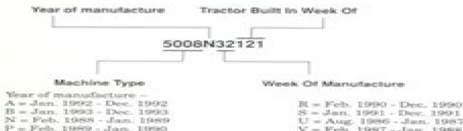
Fig. 3—The tractor serial number identifies machine type, year of manufacture, week of manufacture during specific year, and specific unit manufactured during that week. The example shown identifies a two-wheel-drive 390 tractor which was the 121st tractor manufactured during the 32nd week of 1988.

Machine type — 5006 M-F 375 2WD 5007 M-F 375 4WD 5008 M-F 390 2WD 5009 M-F 390 4WD 5010 M-F 398 2WD 5011 M-F 398 4WD 5206 M-F 383 2WD