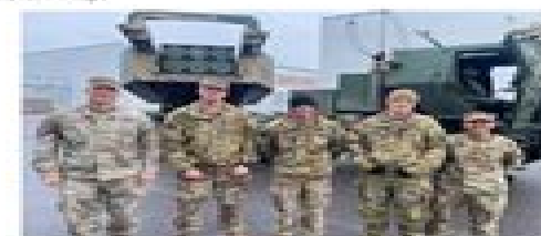
American HIMARS unit based at the Tapa Military Base in Estonia.

KPSF participants will learn about their Defense Forces to better understand the war in Ukraine. We will discover how Finland's integration into NATO is proceeding and spend time with American troops based in Tapa, Estonia operating the High Mobility Artillery Rocket System and play basketball on the court that KPSF donated in 2021. Lastly, we will visit a school in Tallinn established for Ukrainian teenaged refugees.