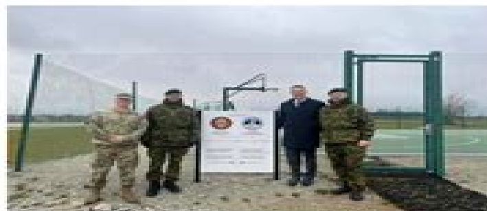
Basketball Court donated to Tapa Military Base by KPSF (Tapa, Estonia).

Bridging the gap between the military and civilian worlds.