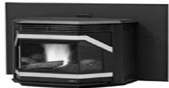
Pellet Insert Model Winslow™ (PI40)

A French manual is available upon request. Order P/N 775,229CF.