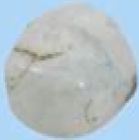
Pierre de lune