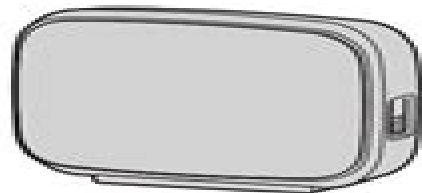
KX-TGP600G/ KX-TGP600CEG/ KX-TGP600UKG