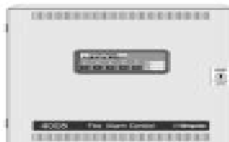
4008-9102 (Beige) Standard Control Panel