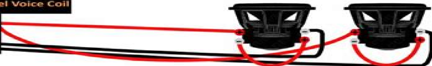
3 Sub, Single (Parallel) Voice Coil