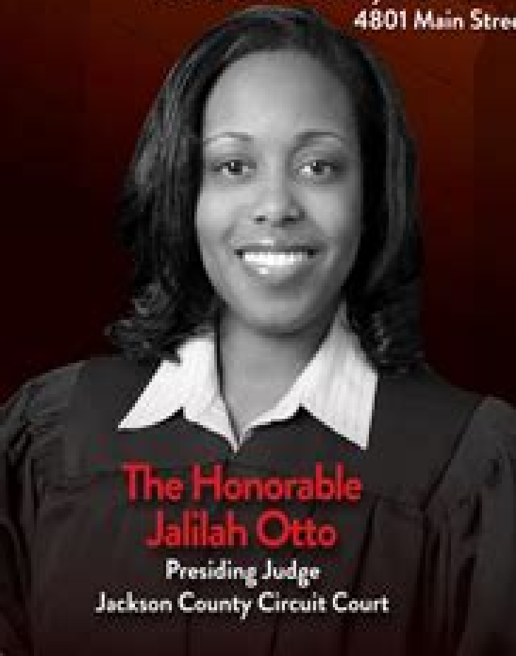
The Honorable Jalilah Otto

4801 Main Street, Suite 1000 (10th floor), Kansas City, MO 64112