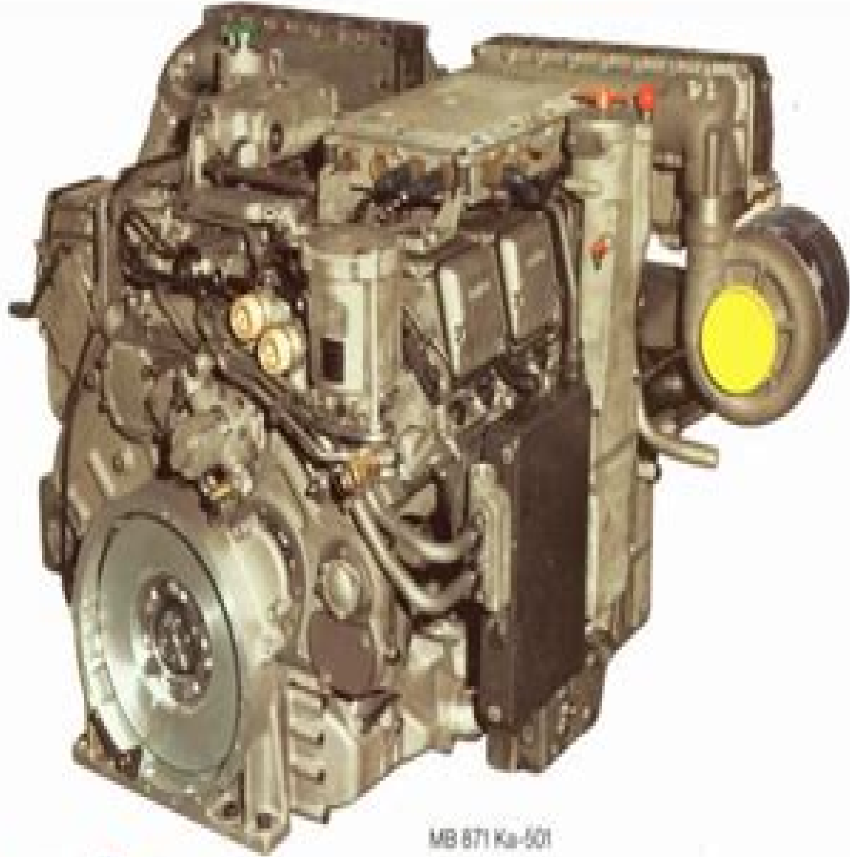
MB 871 Ka-501