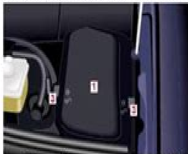
1 - Fuse box in engine compartment, left-hand side 3 - Tabs