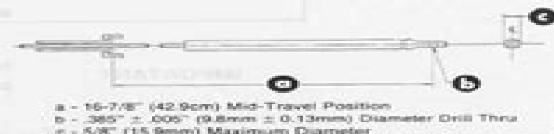
Figure 3. Steering Cable Travel

MerCruiser I Stern Drives, should be 3\frac{1}{4}'' (83mm), 1\frac{1}{4}'' (41.3mm) on each side of mid-travel point. If these dimensions are not complied with, the stern drive will not shift properly into both forward and reverse.