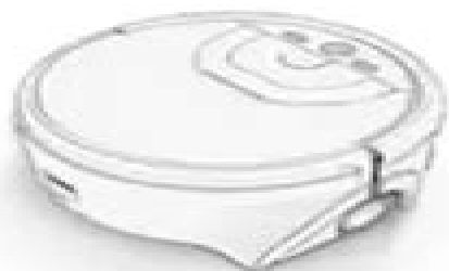
Robot main body (include a main brush)