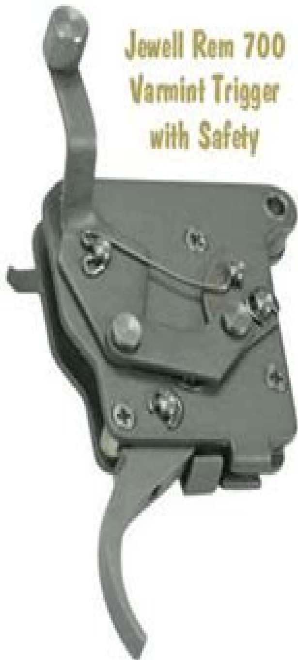
Jewell Rem 700 Varmint Trigger with Safety