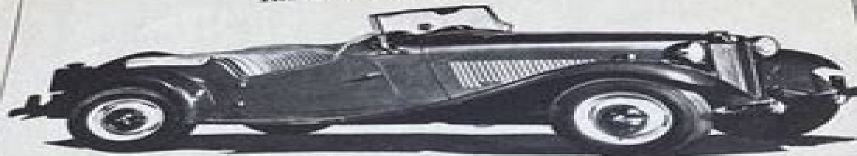
THE M.G. MIDGET (Series "TF")