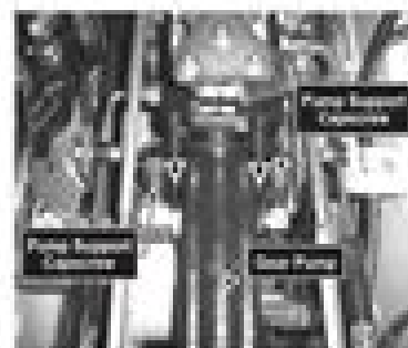
Fig. 7-14 Location of hardware securing the gear pump to the hydrostatic pump