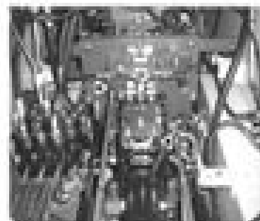
Fig. 7-13 Location to disconnect pump and control rods from hydrostatic pump