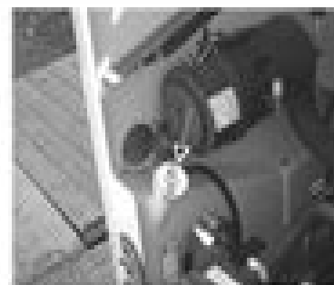
Fig. 7-12 Location of pressure cap on hydraulic oil reservoir