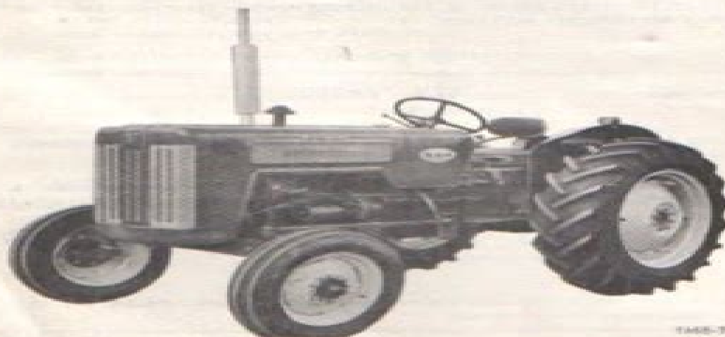
Illustr. 3 Front Right Hand View of B-414 Diesel Tractor