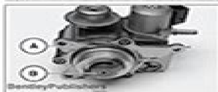
High pressure fuel system service on turbo engine, including replacing HPF fuel pump, 550 Fuel Tank and Fuel Pump