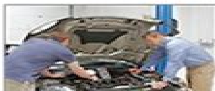
Bentley technical authors testing fuel pump on the Cooper S engine.

Though the do-it-yourself MINI owner will find this manual indispensable as a source of detailed maintenance and repair information, the owner who has no intention of working on his or her car will find that reading and owning this manual makes it possible to discuss repairs more intelligently with a professional technician.