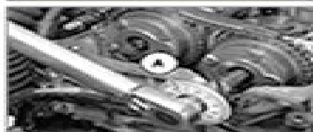
Detailed engine service, including VANOS camshaft timing adjustment N17 Camshaft Timing Chain