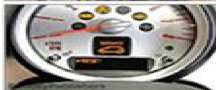
Step-by-step instructions for resetting CBS service item, 620 Maintenance