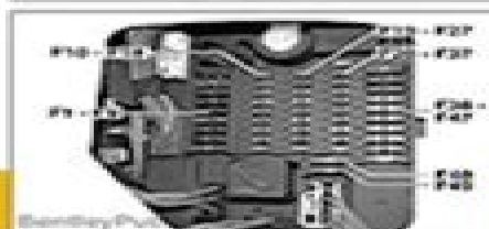
Comprehensive fuse, relay, and electrical component locations, ECU, Electrical Component Locations