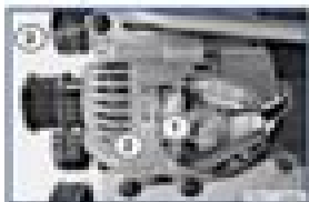
Remove alternator (1).

Disconnect alternator connection (1) and remove mounting (2).