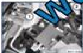
Remove alternator (1).

Remove the alternator (2) from the alternator.