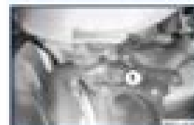
Remove alternator (1).

Remove the alternator (2) from the alternator.