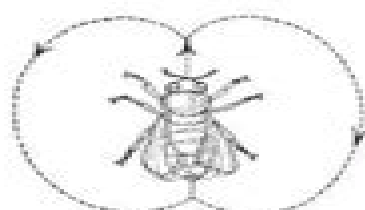
Figure 2. Waggle dance

3.13. What do you mean by natural selection?