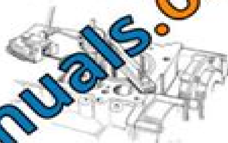
Fig. A-15—Checking cylinder bore extension

A small hole is drilled through the block into the middle groove to provide evidence of instant leakage past the ring.