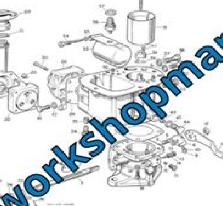
Fig. A-13—Assembly of components to first piston