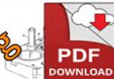
Fig. A-14—Checking piston rings