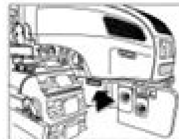
Fig. 3 Chassis Code and Serial Number

To update the user who is involved in identification of the tractor, please send a copy of this manual to the dealer or to the manufacturer's address.