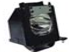
The Lamps are numbered 1 to 100. 100-001 to 100-0100 100-011 to 100-0200 100-021 to 100-0300 100-031 to 100-0400 100-041 to 100-0500