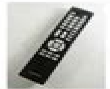
Wholesale Remedy Control Phone Number: 0800 679 000 0800 679 000 Email: wholesale@remedycontrol.co.uk