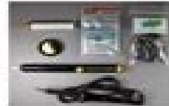
1.64 401 CTD USB PCIE-Port CAM040807V1, LCD TV, Complete Repair Kit w/ 11 Capacitors and Soldering Accessories (Shipping from $26.29 $6.99-20.00) = 0