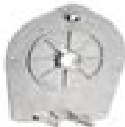
Ullergård PGP: 0623 Anterior Blau