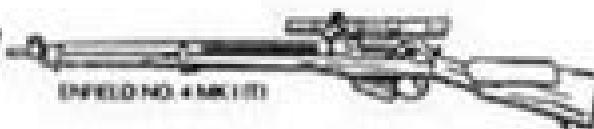
ENFIELD NO. 4 MK. 1 (7)

The No. 4 Mk. 1 rifle was developed from the No. 1 SMLE between the World Wars. It retained the basic Lee action design of the No. 1 rifle, but was extensively modified to improve performance and made easier to manufacture.